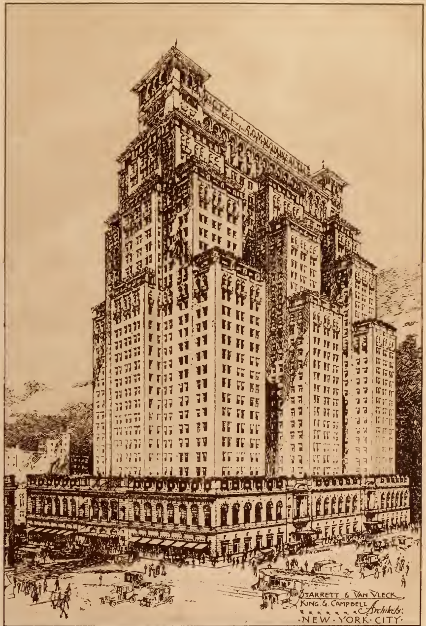
HOTEL COMMONWEALTH. Architects' Drawing of the proposed Commonwealth Hotel, which it is claimed will be the last word in modern comfort and convenience. STARRETT & VAN VLECK KING & CAMPBELL Architects NEW YORK CITY.